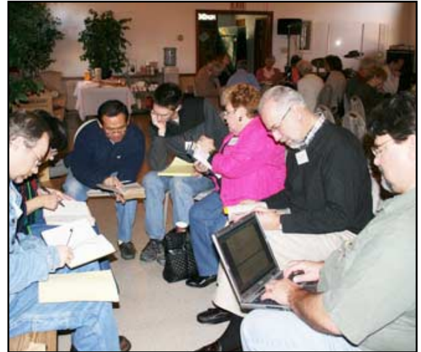
Participants at the Winter Assembly dig into the Bible as part of a unique exercise in developing a canon for PSMC.

For more, see page 6 and check out the official website at www.sanjose2007.org